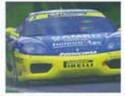
url : 360 Challenge Cup In ITALY

Ferrari Racing car with Immun'Age Logo is participating the races in Italy and attracting attention of motor fans all over the world.