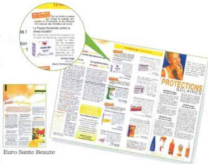
Euro Sante Beaute

* Immun'Age is a functional food to control oxidative stress by activating the physiological process of antioxidation.