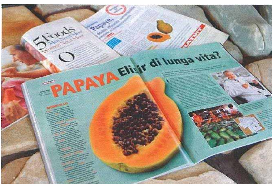
Not only TV but also many magazines covered the story of "PAPAYA POWER". It has been drawing wide media attention in all over the world.